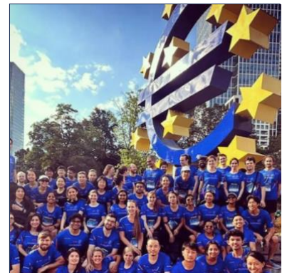
Department of Heart and Lung Research Max Planck Institute München, Germany

Beyond the lab, I had the opportunity to present my work at the “Molecular Control for Gene Expression” Spring School in Austria, connecting with researchers from various countries. I also joined my colleagues for the JP Morgan Corporate Challenge Run in Frankfurt for a 6 km race. As a Lebanese international student at RadboudUMC, embracing life in Germany and my interaction with colleagues broadened my international horizons and shed light on the importance of collaborative spirit in the scientific community. This internship was not just a learning experience, but a journey filled with exciting challenges and wonderful people.